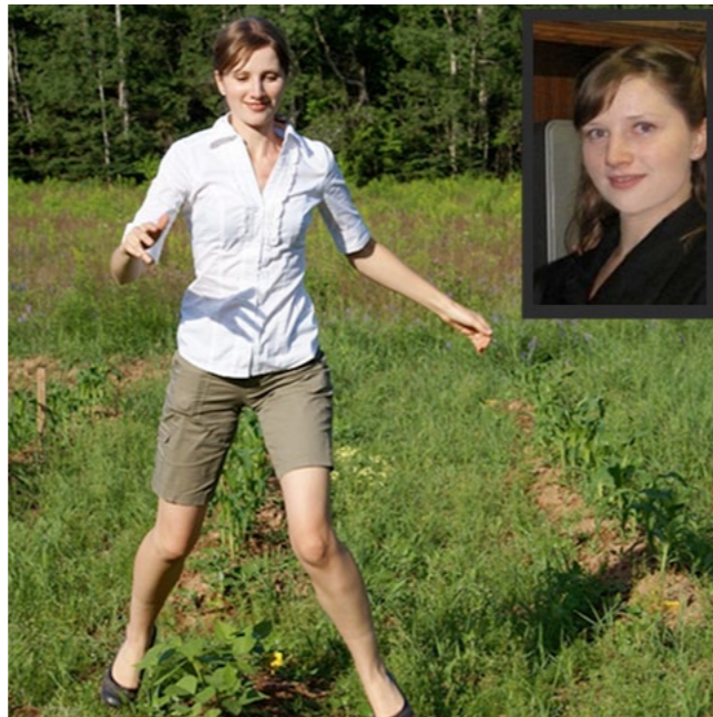
I didn't start out as healthy as I am now.

Even though I was raised by health-conscious parents, I always detested my mother's healthy casseroles. I snuck as much junk food as I could, and as I grew up my eating habits got worse and worse. I'd hide bags of chips, pastries and candy in my room.